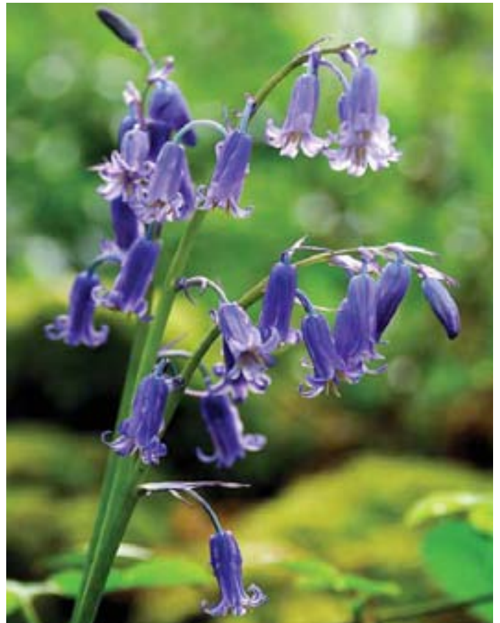
Bluebells are protected and can be seen at the park in April and May.

Two Royal Navy ships have been named HMS Bluebell.