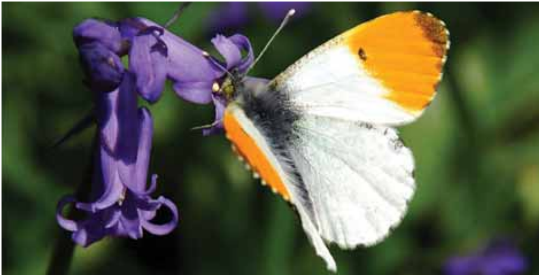
Dams to Darnley Country Park is home to wildlife waiting to be discovered this spring.

This is the third edition of Wagtail , the newsletter and events calendar for Dams to Darnley Country Park.