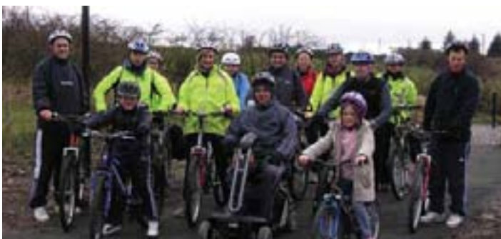
Visitors saddled up to join the on yer bike event at the country park.

Nature detectives were looking for animal tracks and trails around Darnley Mill in January. Some were spotted, including deer tracks, but the earlier rain made most signs elusive.