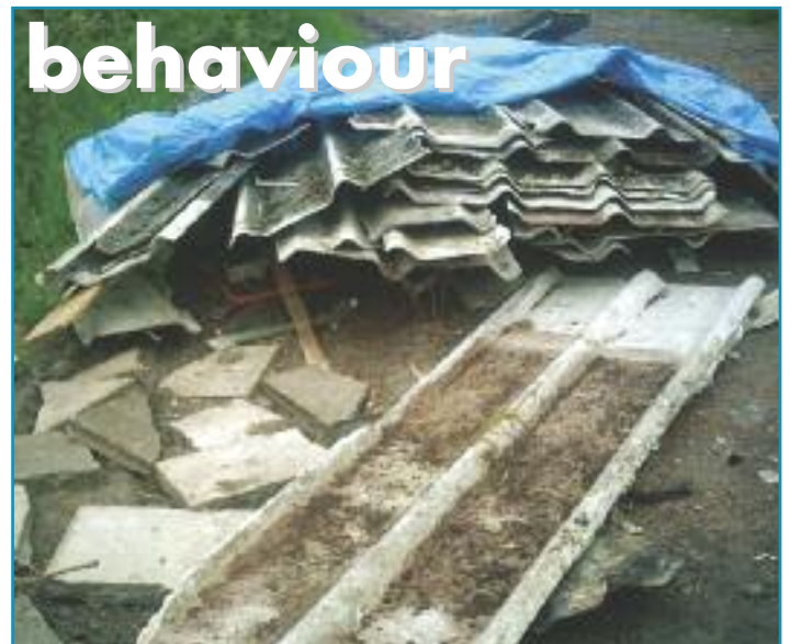
Asbestos found dumped on Corselet Road on 16 May 2009.

Please help maintain the country park as an attractive area for peace and enjoyment by reporting any problems.