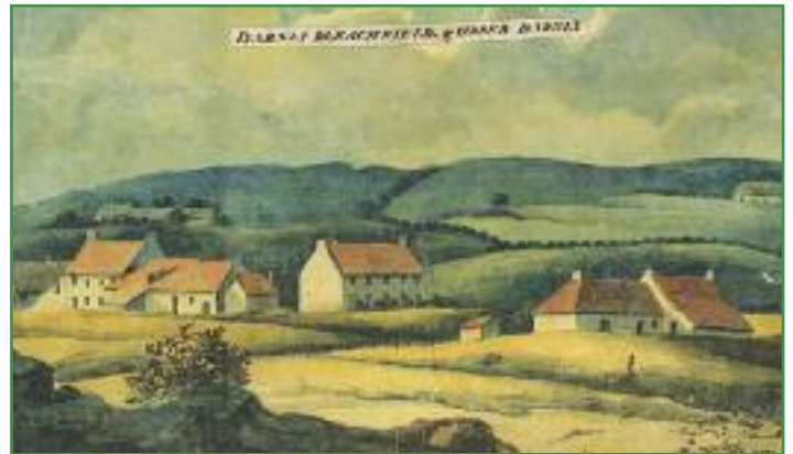
Painting commissioned by the Maxwell family c.1830.

Within the bleachfields there were various man-made ponds and reservoirs, the largest of which was later used as a curling pond. The reservoirs allowed burn water to settle and clear. The field included workers houses, a laundry, boiling houses, starchworks and stove houses; also pigsties and dungsteads. Textiles produced were very valuable; the field was a target of thieves and was robbed in 1819. The post-1811 buildings were located at the bottom end of the main lade. Most have been covered by landfill, but the lower courses of a few buildings survive today.